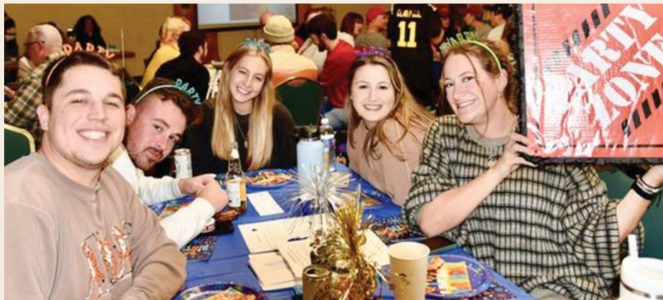
Friends and family having a great time at the E. Morgan Heckler Foundation's first Trivia Night.

More info at EMorganHecklerFoundation.org info@EMorganHecklerFoundation.org